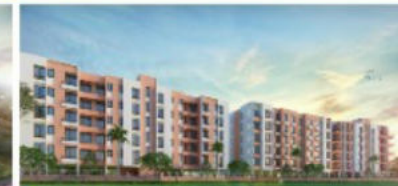
KALIM MENAGE (KHARAGPUR)