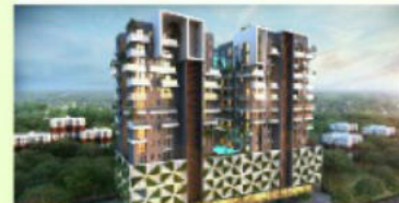
KALIM EDIFICE (A.J.C. BOSE ROAD)