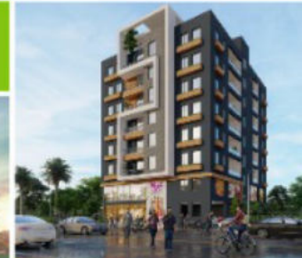
KALIM CAPITOL (A.J.C. BOSE ROAD)