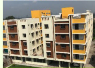
GREEN WOOD NEST (RUPNARAYANPUR)