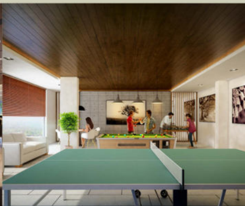
Indoor Game Room