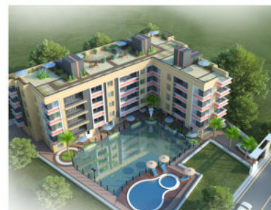
Bhawani Lake View Birati