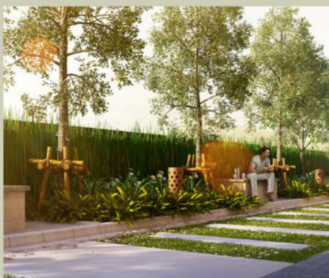
Outdoor Play Area