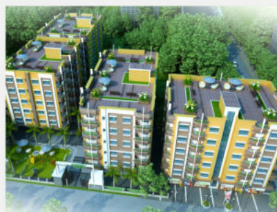
Bhawani Allen Enclave Kestopur