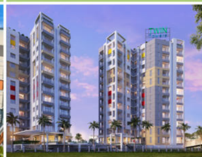
Bhawani Twin Tower Howrah, GT Road