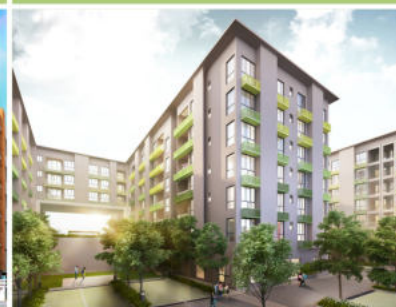
Bhawani Courtyard BT College, Jessore Road