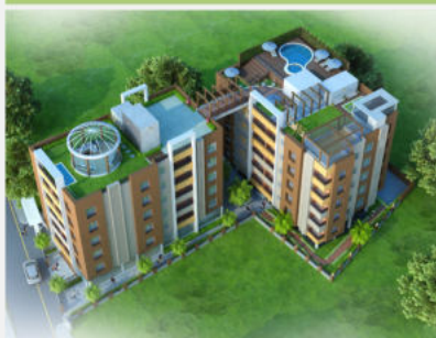
Bhawani Exotica Lake Town