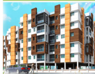
Bhawani Sunvalley Lake Town