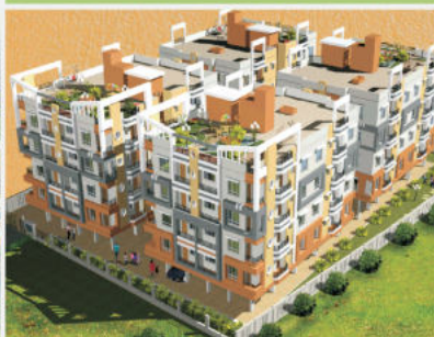
Bhawani North View Baguihati