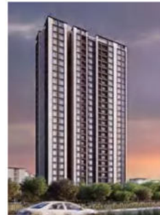
The Crown Beliaghata