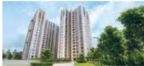
Ozone South EM Bypass