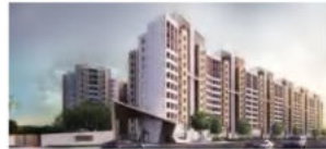
Eternis Jessore Road