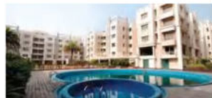
Srijan Midlands Madhyamgram, Jessore Road