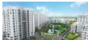
Greenfield City near Behala Chowrasta Metro