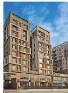
PS Magnum VIP Road