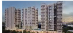
Joy 98 Baranagar

NPR strives to deliver superior quality homes at competitive prices with a belief in complete transparency to create assets that appreciate over time.