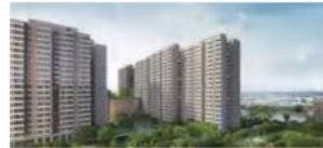
One 10 New Town