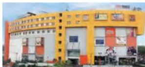
Galaxy Mall Asansol