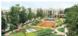
Sherwood Estate Narendrapur