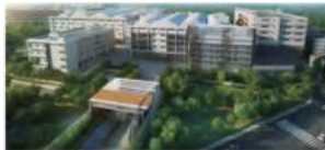
Srijan Industrial Logistic Park NH 6