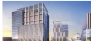
PS Srijan Corporate Park Sector V, Salt Lake City