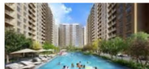
The 102 Joka

With CARE rating A-, it is featured on 'Great Places to Work' and has ensured happiness over the years for over 10,000 residents.