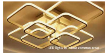
LED lights in indoor common areas

LED lights that consume almost 30% less electricity in comparison to other lights will help SOLUS reduce the energy consumption for the building making it energy efficient.