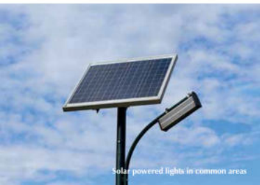
Solar powered lights in common areas

SOLUS will house solar panels. The energy generated from these will be able to cater to the lighting of the common areas of the building. This will make SOLUS immensely energy efficient.