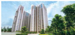
Ozone South EM Bypass