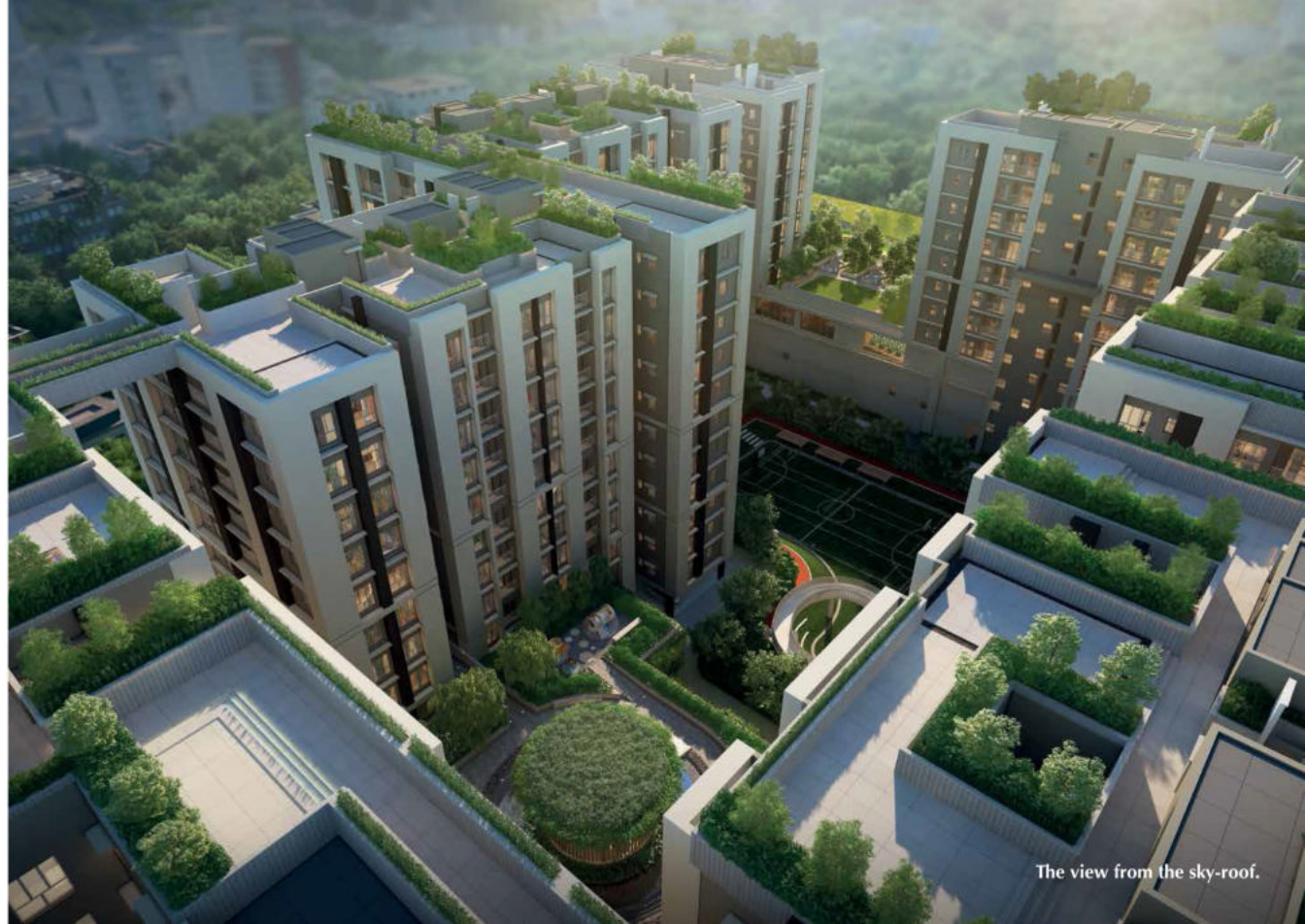
The view from the sky-roof.

Reputed schools like Julian Day, Calcutta Public School, Euro Kids, Little Laureates ... are well close by and all other schools buses will pick up students from SOLUS gate.