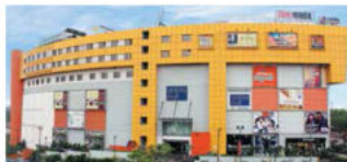
Galaxy Mall Asansol