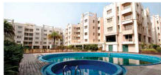
Srijan Midlands Madhyamgram, Jessore Road