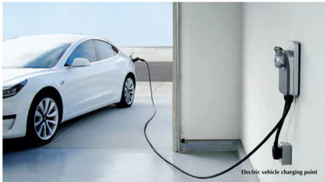
Electric vehicle charging point

With rising fuel prices there is and will be a propensity to shift to renewable resources for vehicles. Which is why, the usage of electric vehicles are on the rise. A platinum rated building will have to have electric vehicle charging points to provide residents the provisions to charge electric vehicles. SOLUS will have 5% of the parking area devoted to this in the ground floor parking area.