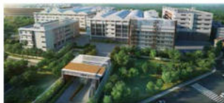
Srijan Industrial Logistic Park NH 6