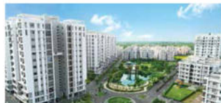
Greenfield City near Behala Chowrasta Metro