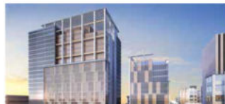
PS Srijan Corporate Park Sector V, Salt Lake City