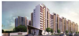
Eternis Jessore Road