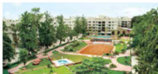
Sherwood Estate Navendrapur

Srijan is also constructing a hospital in Salasar that will aim at addressing the secondary healthcare needs of thousands while its contiguous property engages in organic farming.